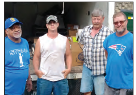
Lafayette County Enterprises in Higginsville has several new contracts, including a recycling partnership with the Lexington R-V School District.