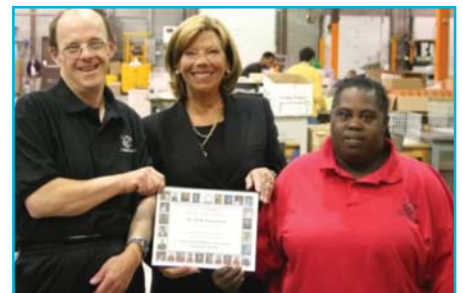
U.S. Congresswoman Jo Ann Emerson was presented a certificate of appreciation during her visit to VIP Industries in Cape Girardeau.

tered workshops, as well as in appreciation of National Disability Employment Awareness month.