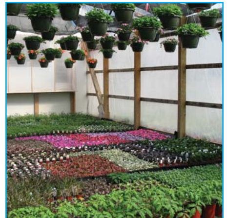
Central Missouri Subcontracting Enterprises in Columbia fought loss of business by opening a new greenhouse operation that has proven to be a major success.