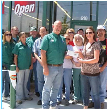
Representatives of the O'Rileys Auto store presented the Warren County Workshop with a donation after their grand opening.