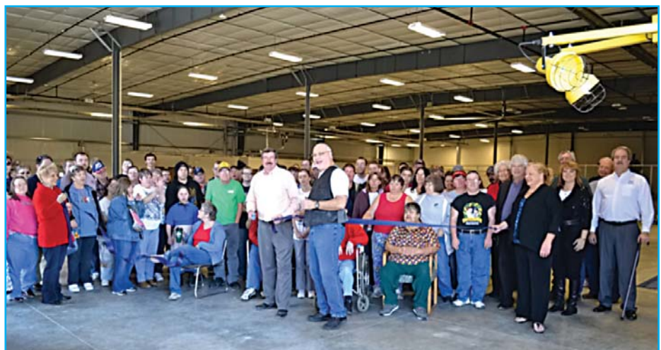
Web-Co's recycling center reopened in Marshfield with employees and supporters gathering for this ribbon cutting.