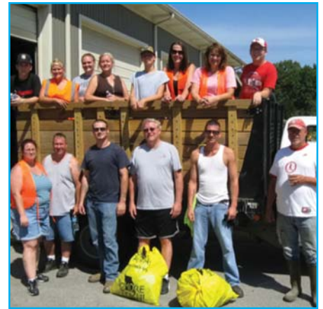
Warren County staff members clean the highways for Innsbrook Village, one Saturday each month.