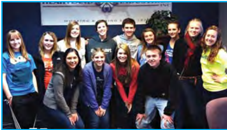
Volunteers from Helias Catholic High School in Jefferson City are helping at Heartland Industries.

full time and 2-3 part time individuals. Only three months into the operation, over 50 tons of books have already been recycled by packing the debound books in gaylords and shipping them to a local recycling center. As space allows, future plans include the purchase of a baler for additional work opportunities for participants in the recycling program.