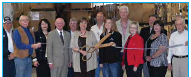
A ribbon cutting opened the new warehouse at Bates County Industries.

be accepted and is currently being used for loading and unloading, sorting and storage. Extra space has also allowed the formation of recycling partnerships with two nearby towns. Future plans include the addition of a horizontal baler with a conveyor belt.