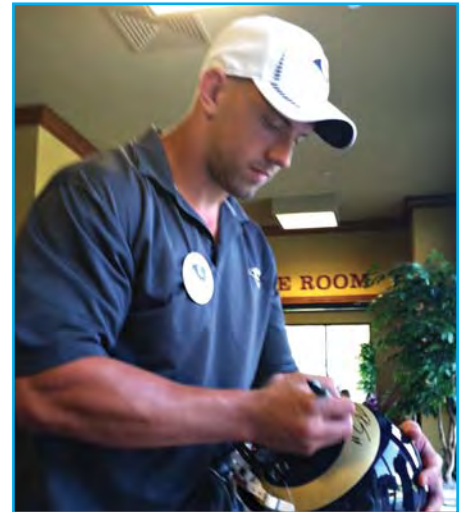
St. Louis Rams’ linebacker, James Laurinaitis took time to autograph a helmet during the Tantone fundraising.