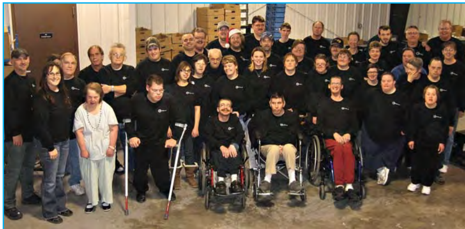
Staff and employees of Gateway Industries of Eldon received a grant from USDA Rural Development, which has allowed them to purchase a baler, conveyor and shredder.