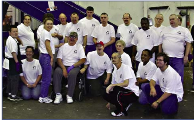
From their beginnings in the 1960s, Missouri's sheltered workshops have consistently pushed creative solutions for job creation. The result has been a grassroots effort that also serves businesses and the community.

Although workshops compete in an open market, the needs of their employees mean extra supervision and other elements that increase workshop overhead. A major step was taken in 1971 with passage of Missouri Senate Bill 40. SB40 provided important funding support by enabling local counties to create tax levies for workshops and residential facilities. Additional funding today includes a