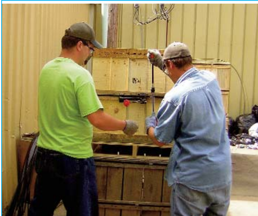
Workshop services include contracts with individual businesses, as well as community wide programs such as recycling.

It’s a formula that is a proven winner for Missouri and Missourians.